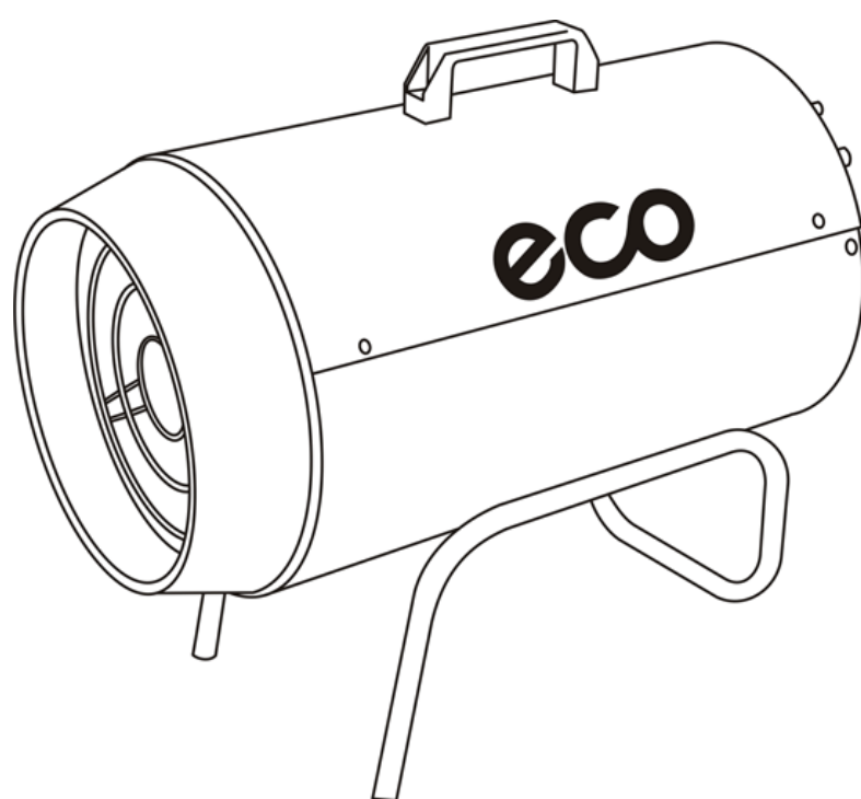
ECO GH 20